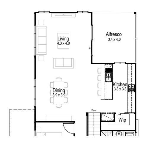
Upper Floor Plan - Alternative Kitchen Option