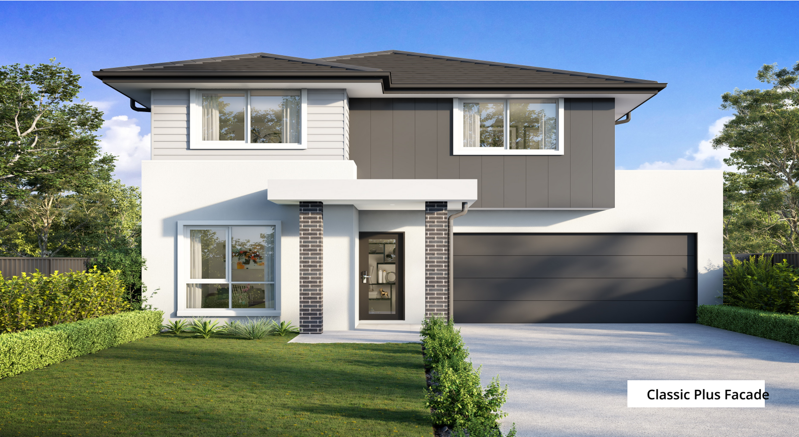
Classic Plus Facade

Lot 3, 18 Sketchely Parade, New Lambton NSW 2305