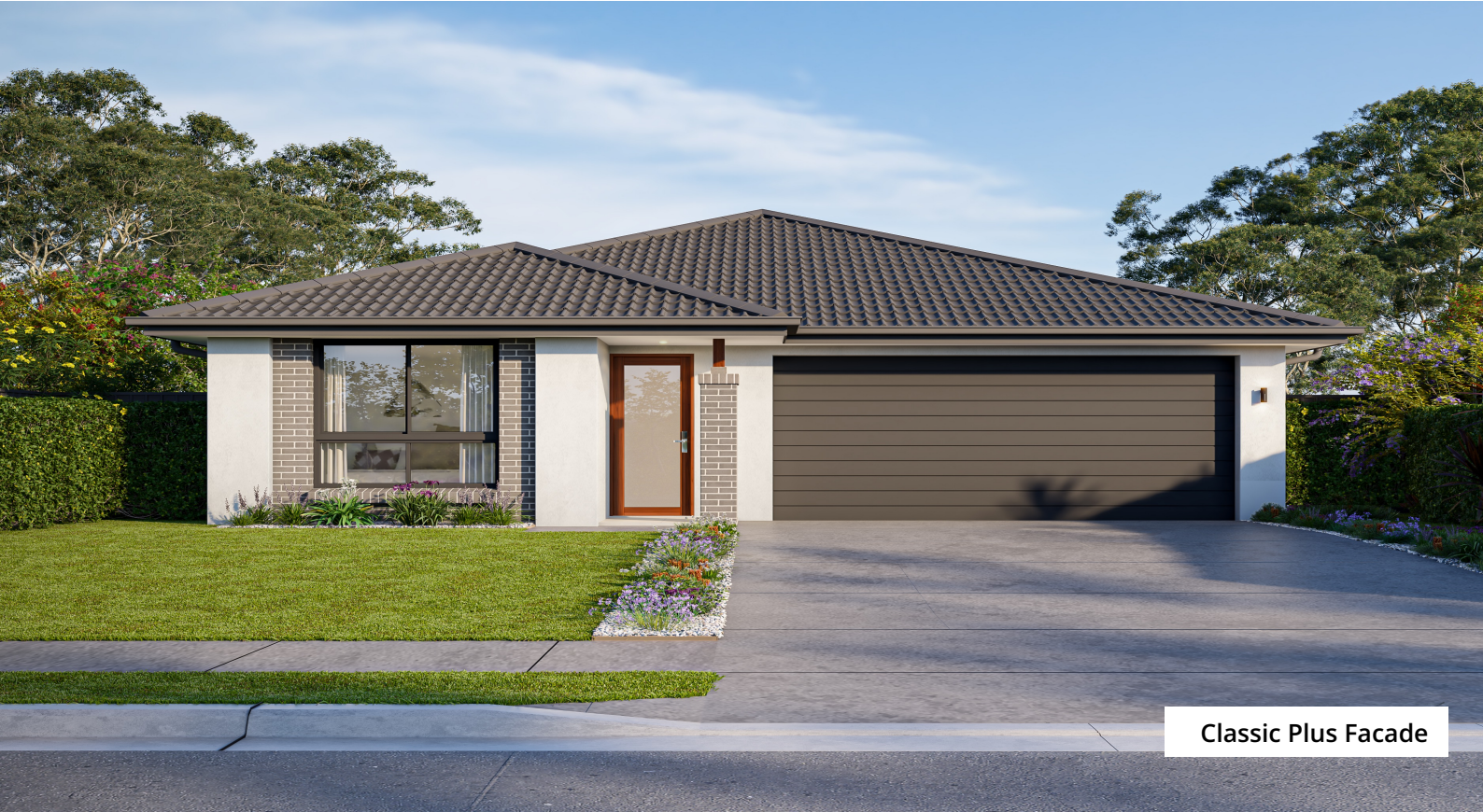
Classic Plus Facade