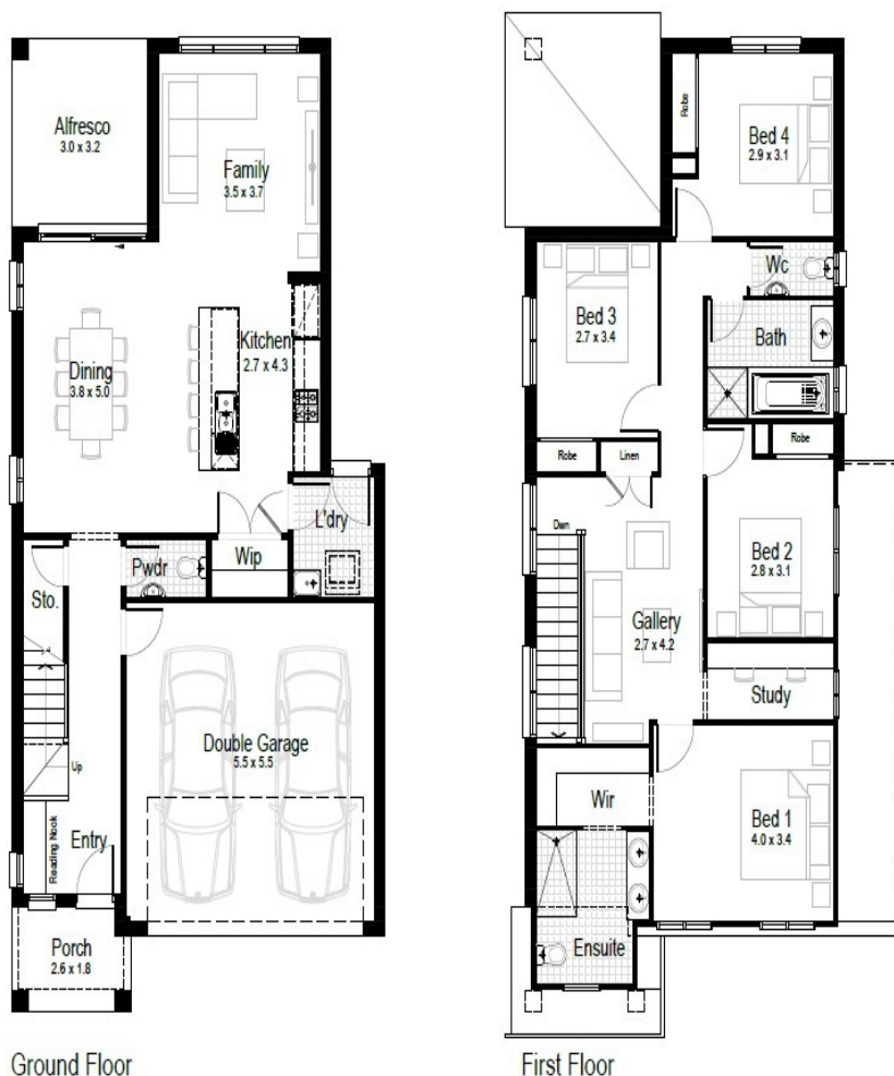
Carolina 24 Classic