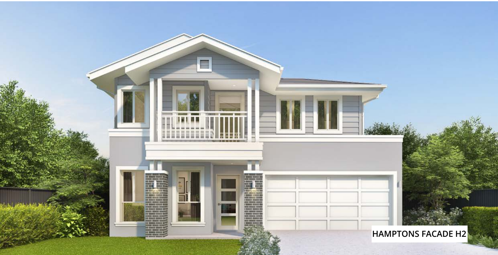
HAMPTONS FACADE H2